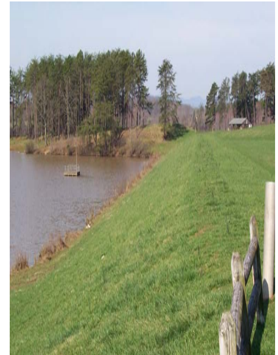
A Typical Earthen Dam. Picture of Mountain Run Lake Dam in Culpeper.